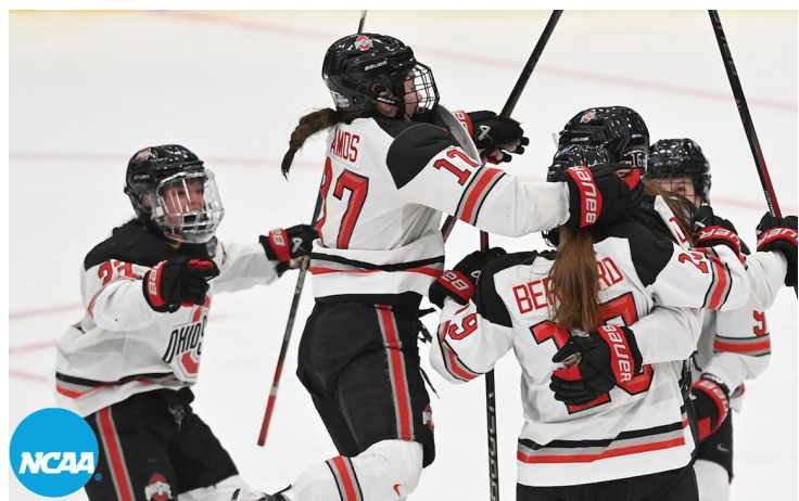
Ohio State women’s hockey celebrates as the final whistle blows.