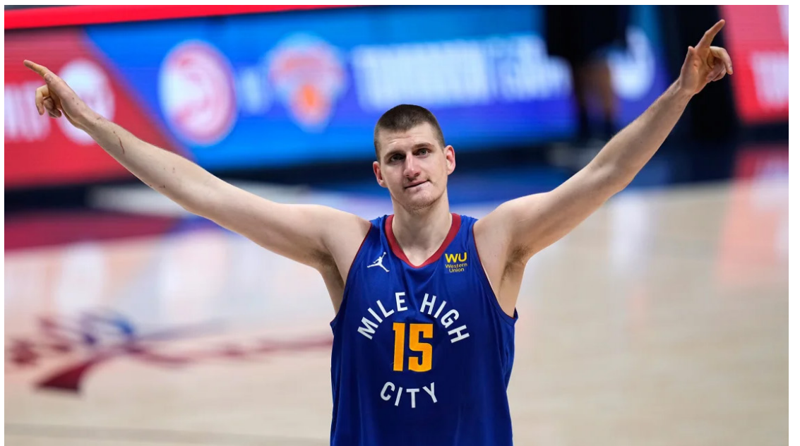
Nikola Jokic Celebrating in the 2021 NBA Season.

record in the Eastern Conference. Giannis Antetokounmpo is having a typical season, averaging 31, 12, and 7 alongside DPOY-caliber defensive play. Lastly, Luka Doncic was the favorite for many at some point throughout the season due to his 34, 9, and 10 stat line, rivaling the best; however, the Mavericks’ spectacular record was the fa-