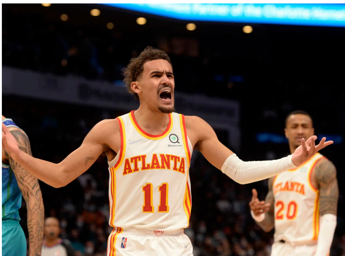
Trae Young (Atlanta Hawks guard) complains to the referee during a win against the Los Angeles Lakers.

Ultimately, as NBA fans, we should acknowledge that NBA referees are all human and make mistakes. However, that is not to say that they should go unpunished. But when the referees are biased and are missing egregious plays because of personal reasons, causing the game to change in drastic ways, that is a problem that must be dealt with. For the integrity and the beauty of the league, the NBA must find better ways to increase the level of proficiency of their referees.