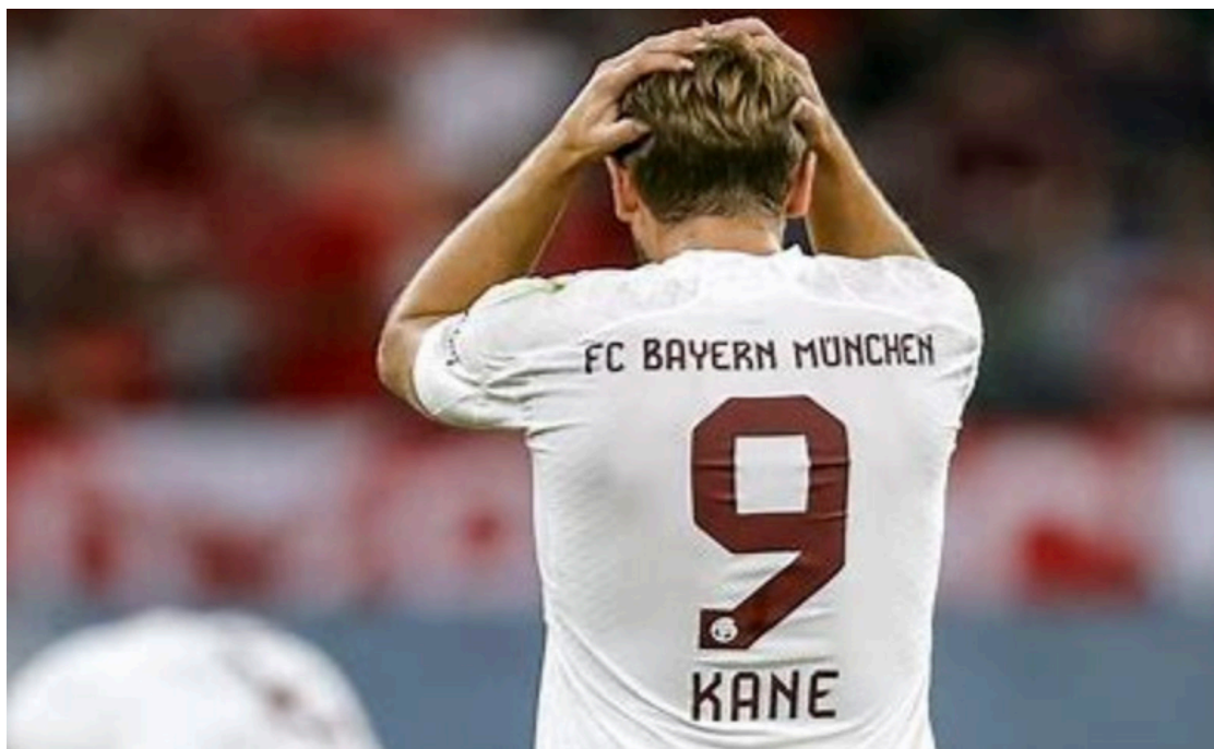
Kane missed out on his first trophy against RB Leipzig in the Super Cup on August 12, 2023.

Harry Kane joined Bayern Munich at the start of the 2023-2024 season. He joined a Bayern team that has won the Bundesliga for 11 years straight, with Dortmund last winning the trophy in 2012. The Bayern Munich dominance doesn’t stop at the league, as they have won the DFB Pokal and the Champions League numerous times. Kane’s