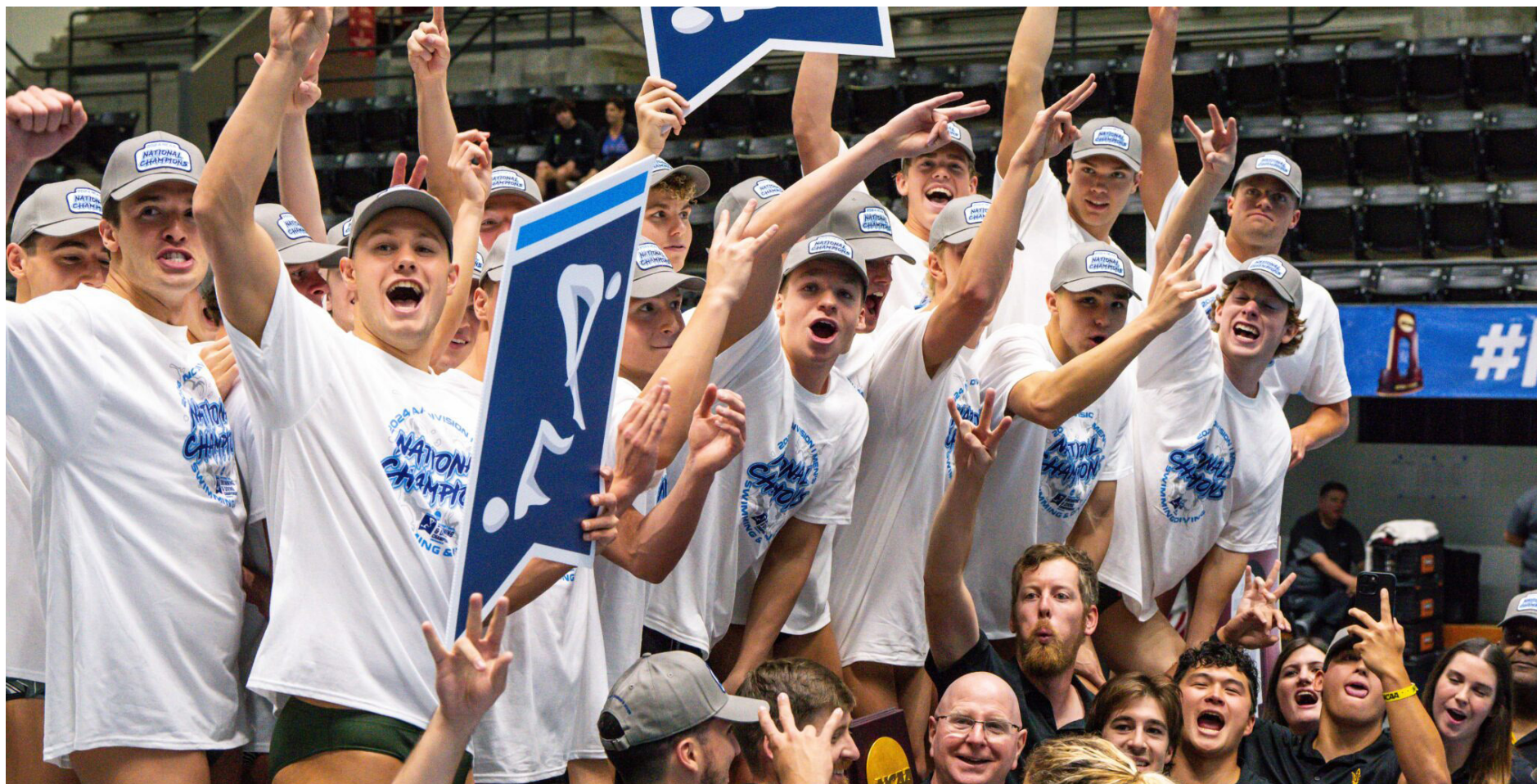
The ASU Sun Devils celebrate their first-ever NCAA Men's Swimming and Diving Championships, led by the legendary Coach Bob Bowman.