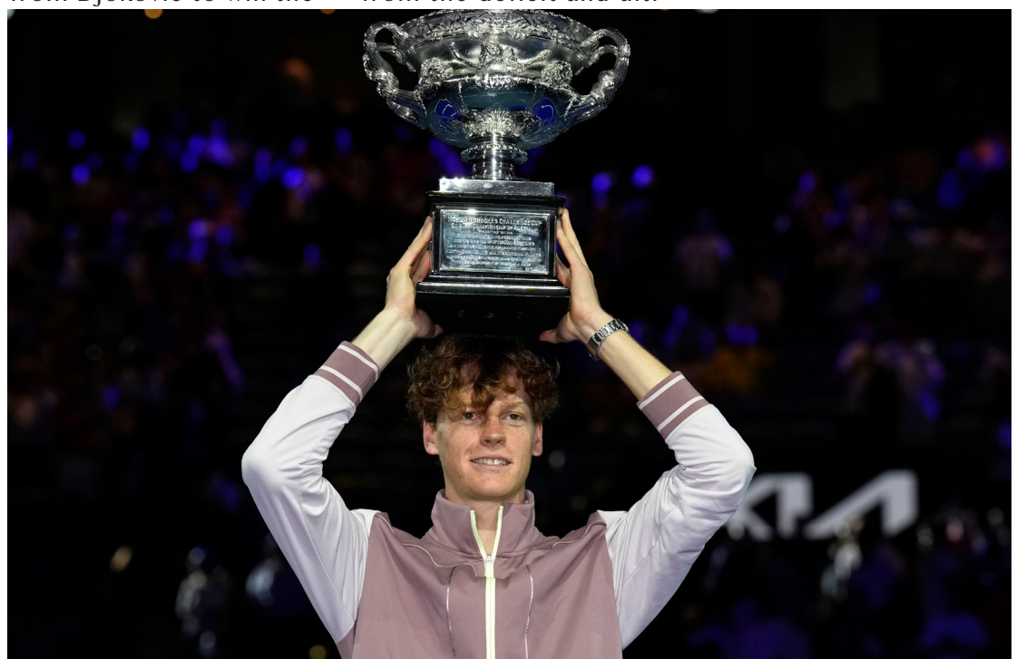
Jannik Sinner holding up his Australian Open trophy.

Sinner has now achieved the holy grail of tennis, a Grand Slam, and doesn't seem to be limiting himself to just Australia. Since his victory in Melbourne in January, he has not slowed down at all, setting his sights on the future. He is a scintillating talent eager to play against the best and to win against the best.