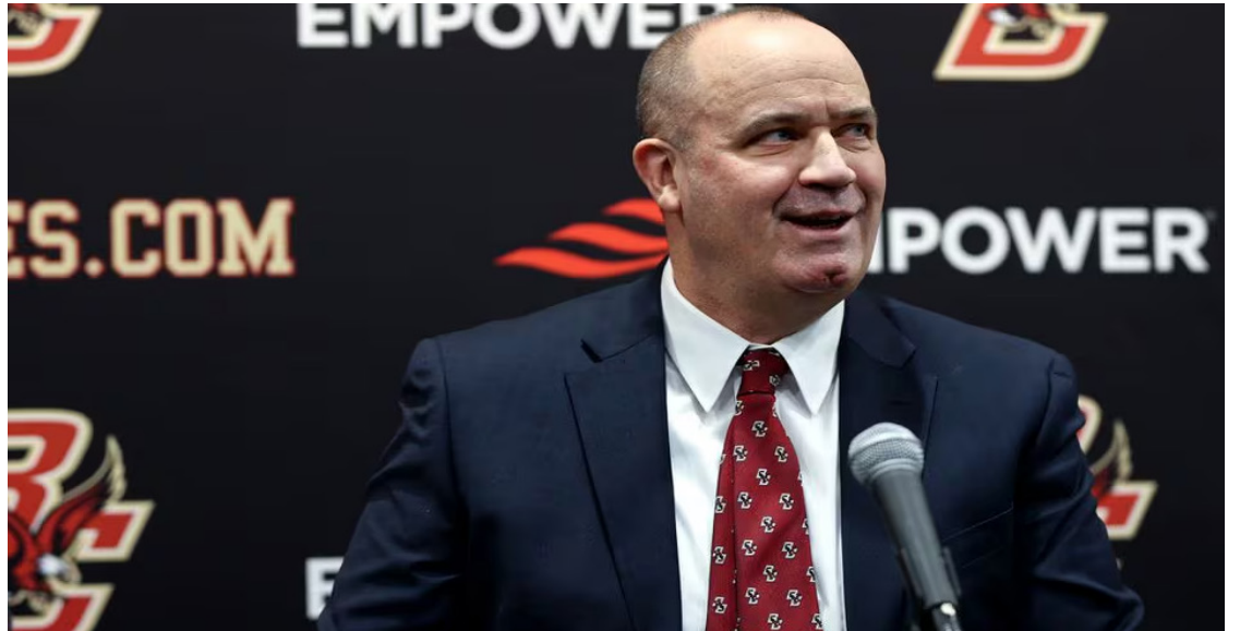
Bill O’Brien at his introductory Boston College press conference.