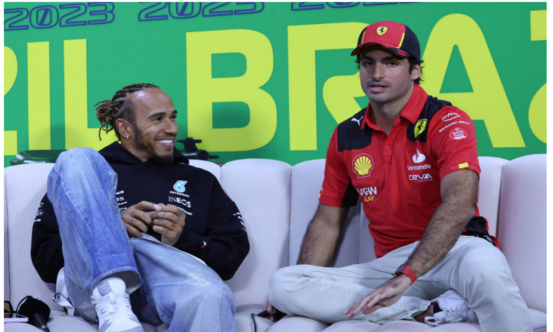
Future 2025 Ferrari driver Lewis Hamilton speaks with Ferrari team principal Fred Vasseur.