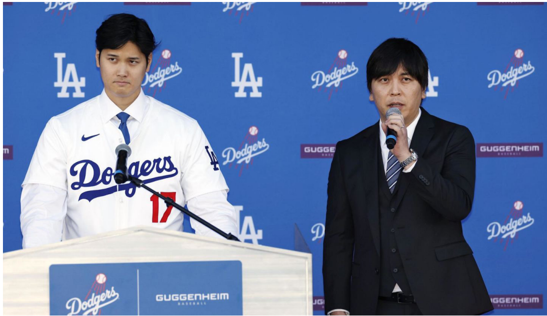
Shohei Ohtani with interpreter Ippei Mizuhara at an introductory press conference on December 14 at Dodger Stadium in Los Angeles.

friend, so he paid off the hefty debts. End of story, right? Mizuhara was fired - the scandal was over. But people are not so sure whether or not Ohtani is innocent. Not all the facts surrounding the bets were released. Some believe that Mizuhara covered for Ohtani, while others believe Ohtani used Mizuhara as a scapegoat. I believe that that is nonsense. Of all the players in baseball, Ohtani has shown the most respect to his opponents, to his management, to his fellow players, and to his fans. One can only keep up an act for so long, and it is safe to say that Ohtani is not acting. Few people like him come around, and accusing him of such blasphemy is simply a way that people who are upset at his greatness try to get back at him - end of story. Shohei's friend made a mistake, Shohei tried to help out and be a good friend.