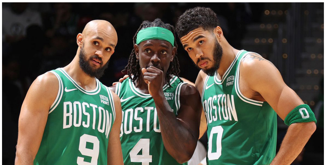
The Boston Celtics are by far the best in the NBA currently, ending the season with a 64-18 record.

has looked mostly unstoppable, sweeping aside other teams, and with the new addition of Holiday and Porzingis to this year's playoff roster, the Celtics will once again be the favorites to win it all. All the Celtics need is to consistently close out games, draw up game plans, and strategically use timeouts. Hopefully, after so many failures, both Mazzula, Tatum and all the players will have matured and learned from our mistakes. Once Boston has that down, their first Larry O'Brien trophy in 15 years is on the way home.