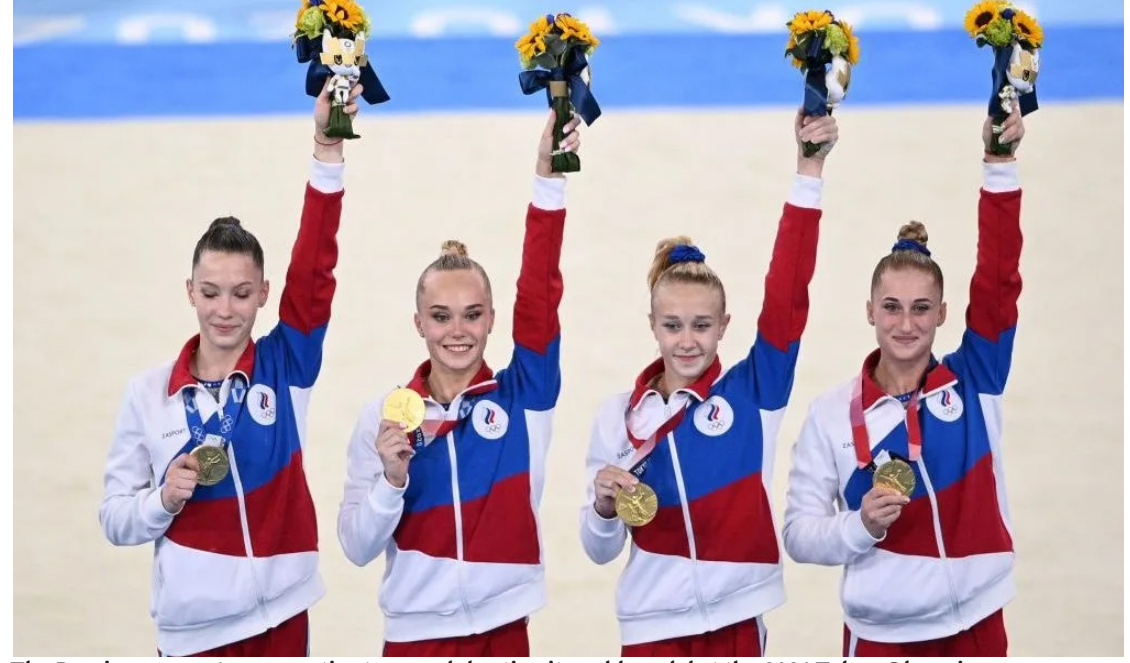
The Russian women's gymnastics team celebrating its gold medal at the 2021 Tokyo Olympics.

loss of certain privileges is a necessary sacrifice if it means increasing the chances of the government backing out of Ukraine. As of now, however, all we can do is wait.