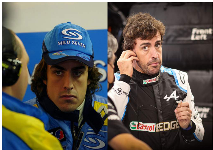
Left: Young Fernando Alonso with Renault. Right: Older Fernando Alonso with Alpine.

At 41 years old, Fernando Alonso is not getting any younger. But in his near 20 years in the sport, he has accomplished almost everything a driver can accomplish, and he isn't done yet. Alonso is still absolutely kicking. It will be exciting to see what he can do in the twilight of his career in his new car. If it's anything like what he's done before, it will be pretty incredible.