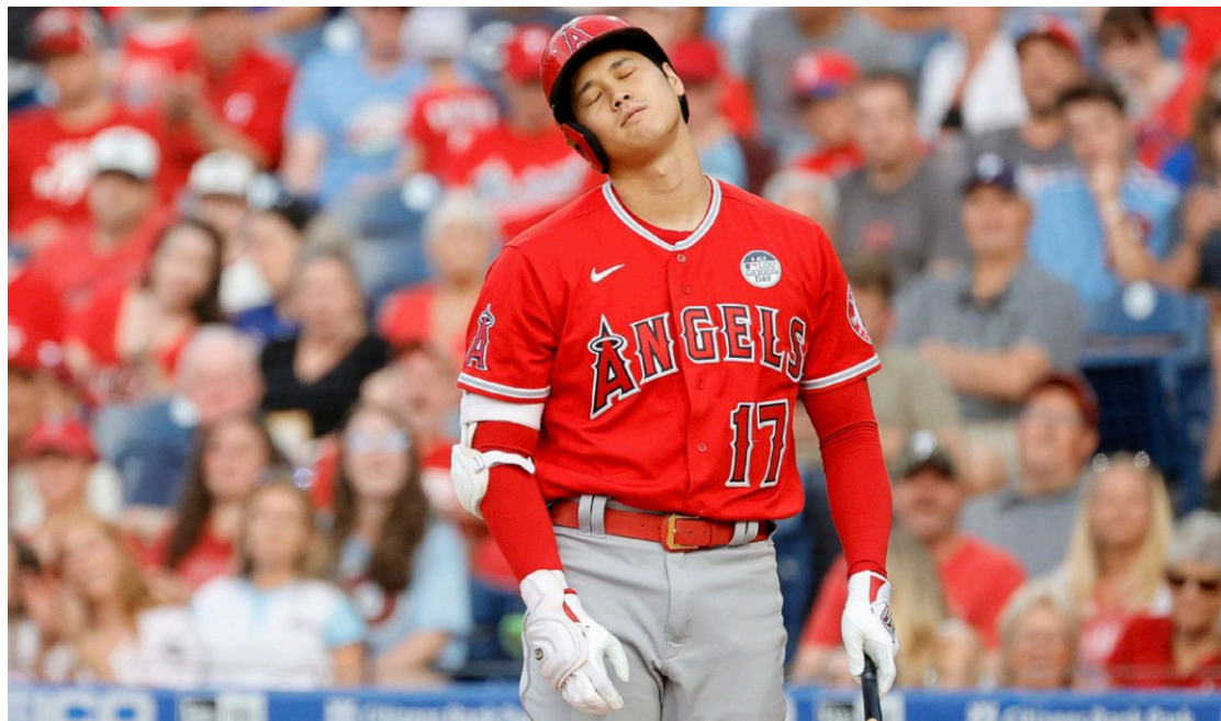
Shohei Ohtani, one of the best players in the Modern Era, serves as the Angels' designated hitter and pitcher.

However, not all hope is lost, and through the darkness, there is light. It starts with pitching, though. Regardless of how great Ohtani is, the fact is that baseball is not a one-man sport. It is fundamentally a team sport, which explains why having such a top-heavy lineup as the Angels do is not a sustainable model in the major leagues. If the Angels want to keep Ohtani from heading to Los Angeles or New York, they must fill the glaring holes in their lineup, which, simply put, won't be easy. Screw you, Arte Moreno.