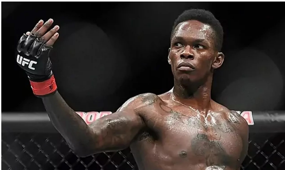
Adesanya stands over his defeated opponent in his iconic Naruto-inspired Rock Lee pose.

say that Pereira was destroying Adesanya for the entire fight up until Adesanya got a hit in, a hit many called "lucky." In my opinion, it doesn't matter whether or not the hit was "lucky" or if Adesanya won by "being a coward," because at the end of the day, Israel is the one walking out of that ring with a belt, and that's what really matters.