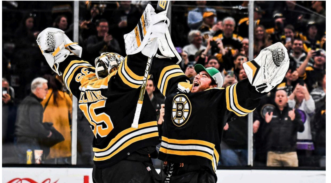
Jeremy Swayman and Linus Ullmark hug after a win.

of The Stanley Cup Playoffs by the Columbus Blue Jackets (later eliminated by the Bruins). The 1995-96 Red Wings, who also had 62 wins, lost in the Western Conference Finals. In fact, since 2013, no Presidents Trophy winner (won the most games that season) has won the Stanley Cup. While much is to be celebrated, the Bruins can't be too confident. Every team must be taken seriously, especially in the Eastern Conference, which has been incredibly strong all year.