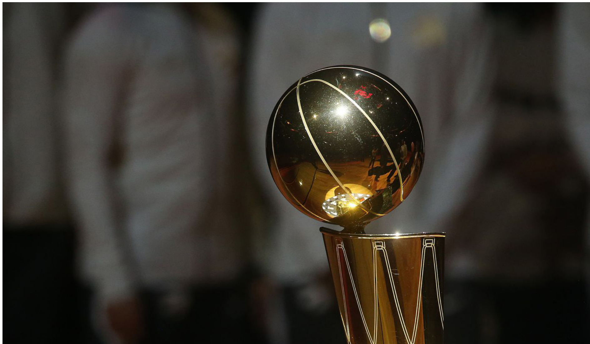
The Larry O'Brien Championship trophy for the NBA Champions at Scotiabank Arena during the Raptors Championship Showcase.