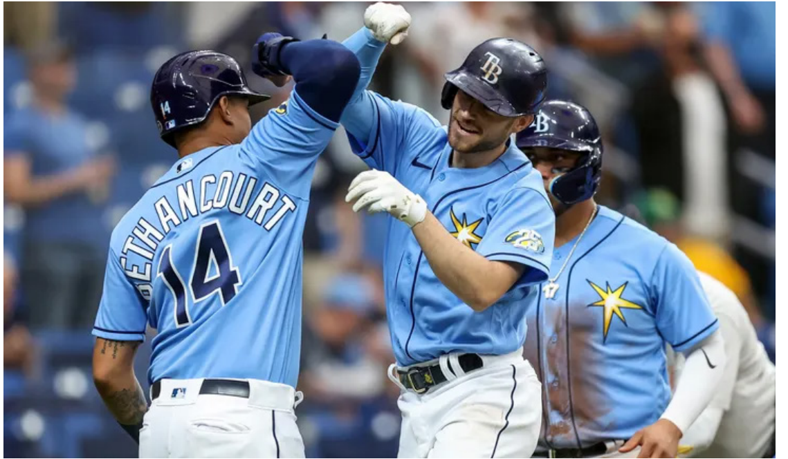
Tampa Bay Rays celebrate after a successful beginning to the new season, entering the 2023 MLB Opener.

Of course, positions, standings, and the abilities of teams will change dramatically throughout the year, as they should. Regardless, a preview of what we have seen from the first two weeks of the season may offer valuable insight into a window to this upcoming October.