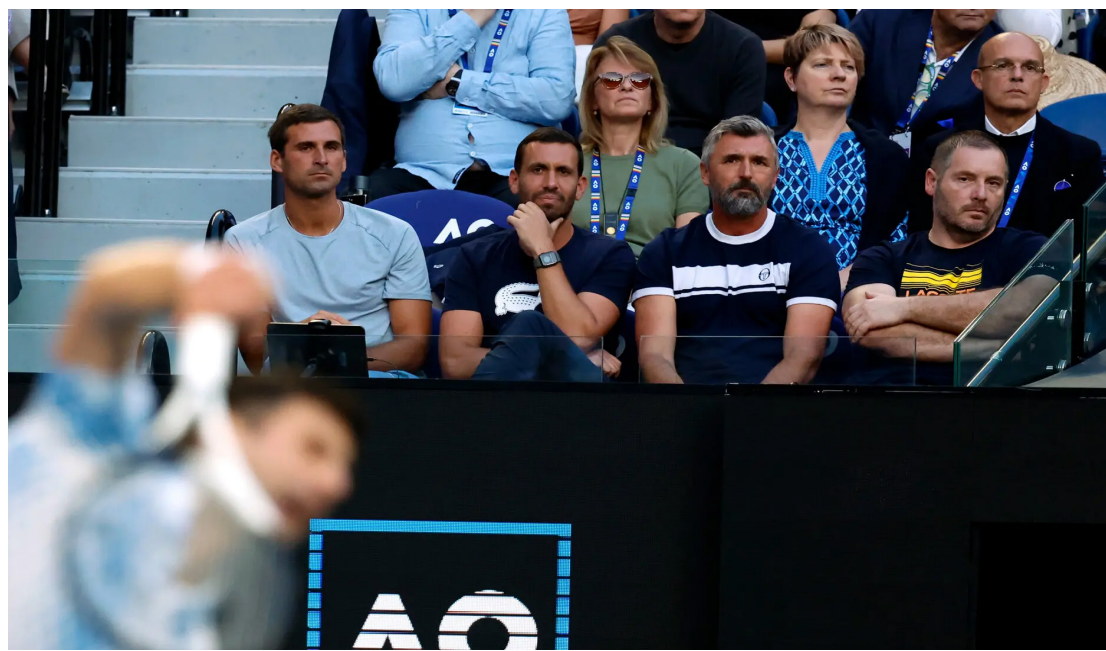
Novak Djokovic at the 2023 Australian Open as Goran Ivanisevic, his coach, watches from the stands (second from the right).

Moreover, some, especially more novice players, may not even be able to afford their coaches to travel with them to tournaments, giving the more affluent an even greater advantage. This would