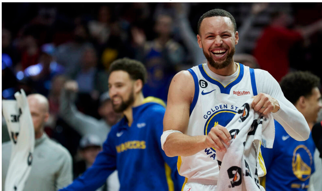
Golden State Warriors guard Stephen Curry reacts after a basket by Jonathan Kuminga.

son finale, the Dubs Dynasty secured the 6th seed for the playoffs after a dominant performance over the Trail Blazers as they finished the game 157 - 101. The Golden State Warriors will face the Sacramento Kings in the first round of the NBA Playoffs.