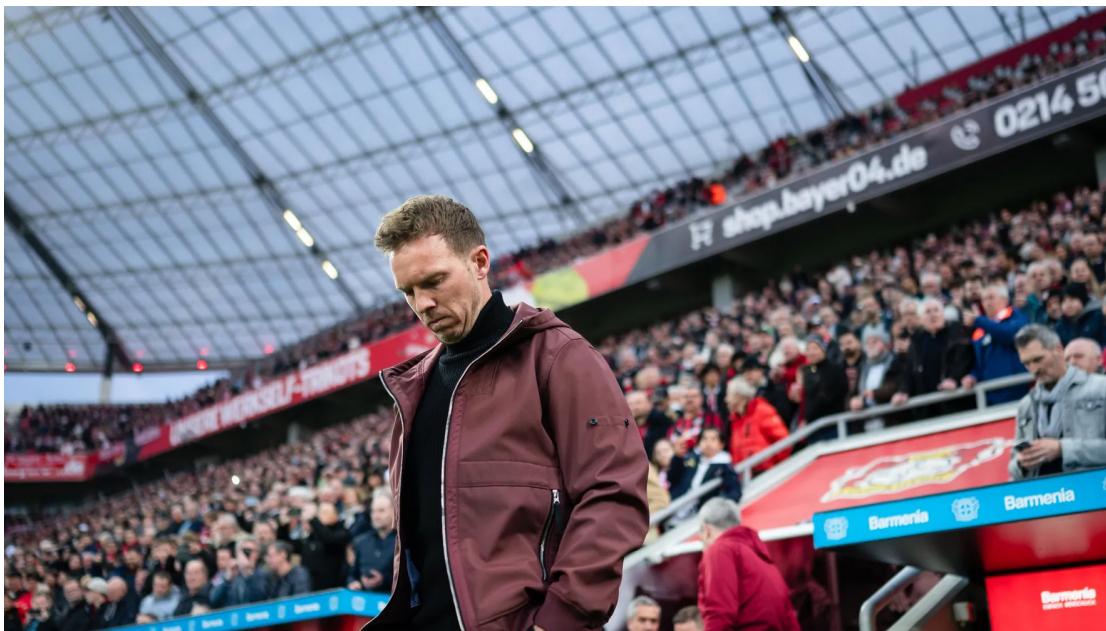
An introspective Julian Nagelsmann at his last game with Bayern Munich.

For Borussia Dortmund, only a handful of points from winning the Bundesliga, Bayern's last-minute management changes may be a blessing. Chelsea, Real Madrid, and Tottenham are all looking for long-term managers, and Nagelsmann may be the young innovator they have been looking for. Through only one sacking among many this season, this move may prove impactful for teams across Europe.