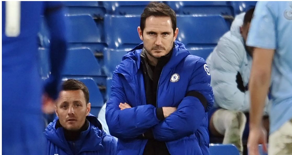
Chelsea manager Frank Lampard looking on from his technical area.

A recurring theme for Chelsea this season is the discontent among fans due to their exorbitant spending in the previous winter and summer transfer windows. Despite this excessive spending, their team needs to perform to the standards expected of them. The fans have been growing increasingly frustrated with this as their hopes of Europe fall further away. While it is unrealistic for Lampard to get them back into European competition, a positive run of form to finish the Premier League could bring hope back to the fans and relieve pressure off the owners.