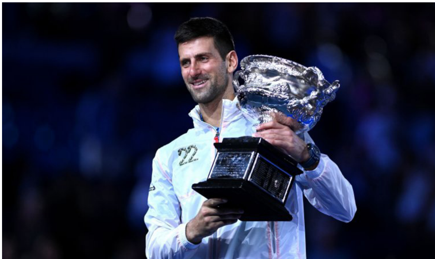
Novak Djokovic claims his 22nd Gram Slam title in 2023 Australian Open men's singles.

Djokovic plays with a mental tenacity that is certainly among the best on the tour, only second behind Nadal. Djokovic has the ability to stay focused and composed even in the most high-pressure situations, often coming back from seemingly impossible positions to win matches. His mental strength allows him to remain calm and confident in the face of adversity, making him a formidable opponent on any court. Overall, Djokovic's dominance in every aspect of the game, coupled with his mental strength, makes him the clear choice as the greatest tennis player of all time. He has shattered records and achieved feats that were once thought impossible, all while maintaining his position at the top of the rankings for an unprecedented length of time. Djokovic has proven himself to be a force to be reckoned with and his legacy in the sport of tennis is truly unparalleled.