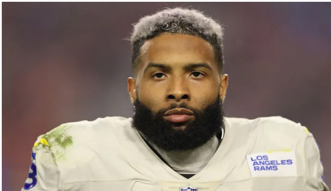
Wide receiver Odell Beckham Jr. during the third quarter of the NFL game against the Arizona Cardinals in 2021.

It was essential for the Ravens to add Beckham to their roster because they were lacking in wide receiver talent. The Raven's wide receiving core consists of Rashod Bateman, Nelson Ashlor, and Devin Duvernay. Even though these players are talented, the Ravens needed a star to help them truly become a Superbowl contender. They needed a Beckham. Beckham has shown his ability to be helpful for a Superbowl-worthy team, the Los Angeles Rams. He signed with them for the 2021-2022 season. That season, he caught five touchdowns over the eight regular season games he played. He also had two touchdowns in the playoffs. In the