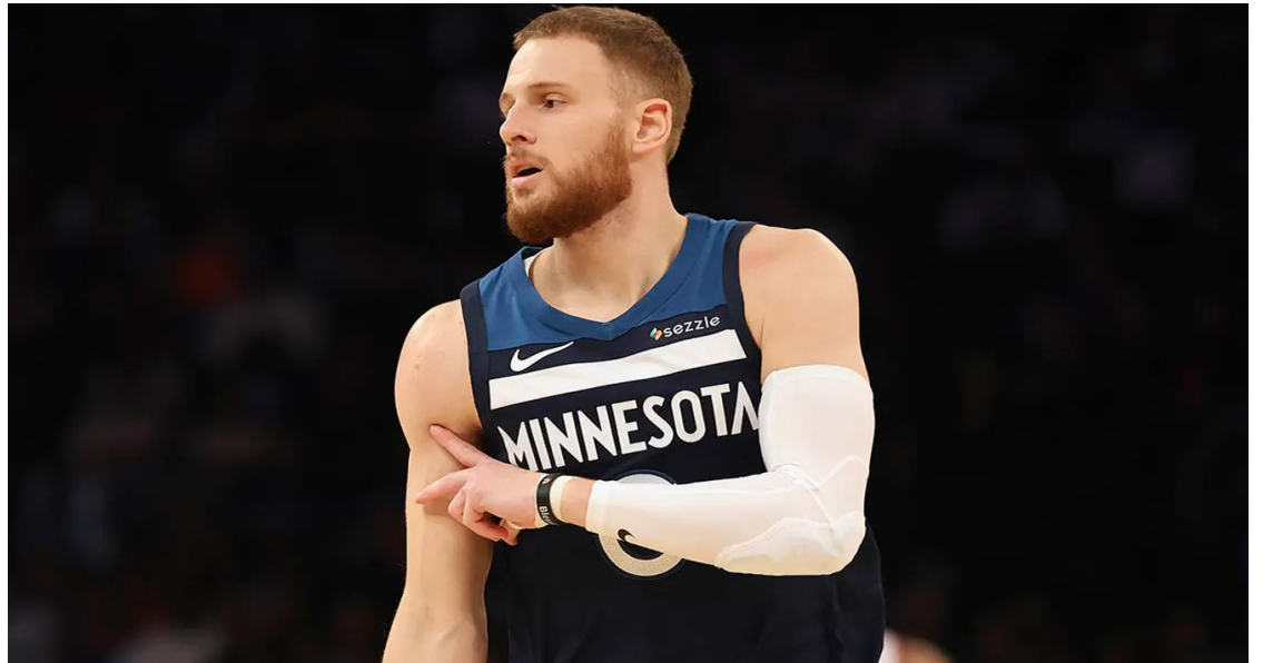
Donte DiVincenzo in his new Minnesota Timberwolves uniform.

Instead, the Knicks opted for a different route. While this trade hurts the hearts of countless Knicks fans, when examining the trade from an objective perspective, you can see that the Knicks could rival the Celtics. If you recall, I said the Celtics had the best starting five in the league. Brunson, coming off a near MVP season, is looking for revenge after being taken down by the Pacers in the second round.