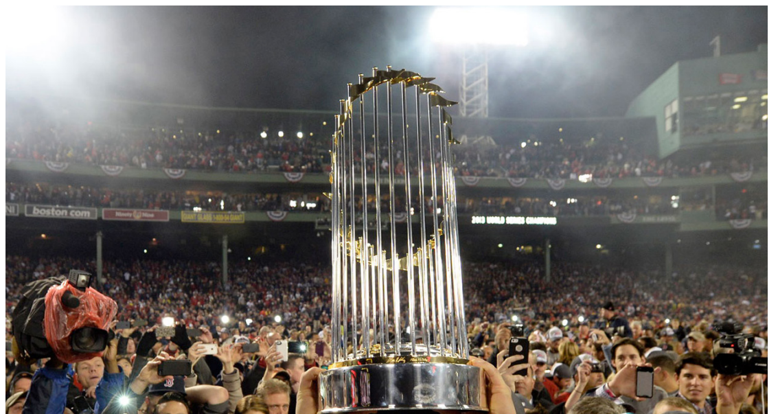
The Commissioner's Trophy is awarded to the World Series winner.

they have a chance to knock off the Yankees with a surprising underdog story. Their pitching, supported by one of the best bullpens in the league, has continuously kept them in close game situations, while their timely offense led by Jose Ramirez and Steve Kwan has pushed them through tough games. If the Guardians are able to push the Yankees to a game seven, I like their chances to win the series through their gritty offense and stellar bullpen.