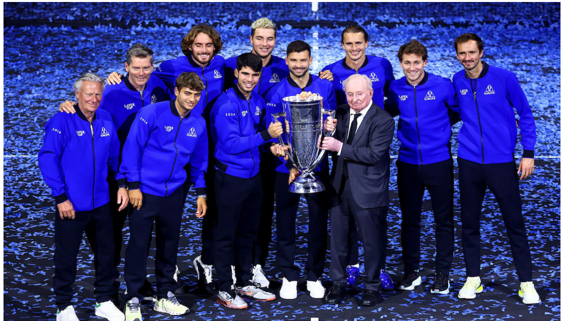
Team Europe celebrating after Carlos Alcaraz's win over Taylor Fritz.

sion and took Team World to a 4-2 lead by beating Medvedev in a grueling three-set match, 3-6 6-4 10-5. Alcaraz immediately followed that up with a decisive 6-4 6-4 win over Shelton to level the score. Leading into the night session, Fritz was able to capitalize on Zverev's weaker serve and beat him 6-4 7-5. Heading into doubles, Team World knew that winning this match would take them into a 4-point lead. They effectively capitalized, winning 6-2, 6-1.