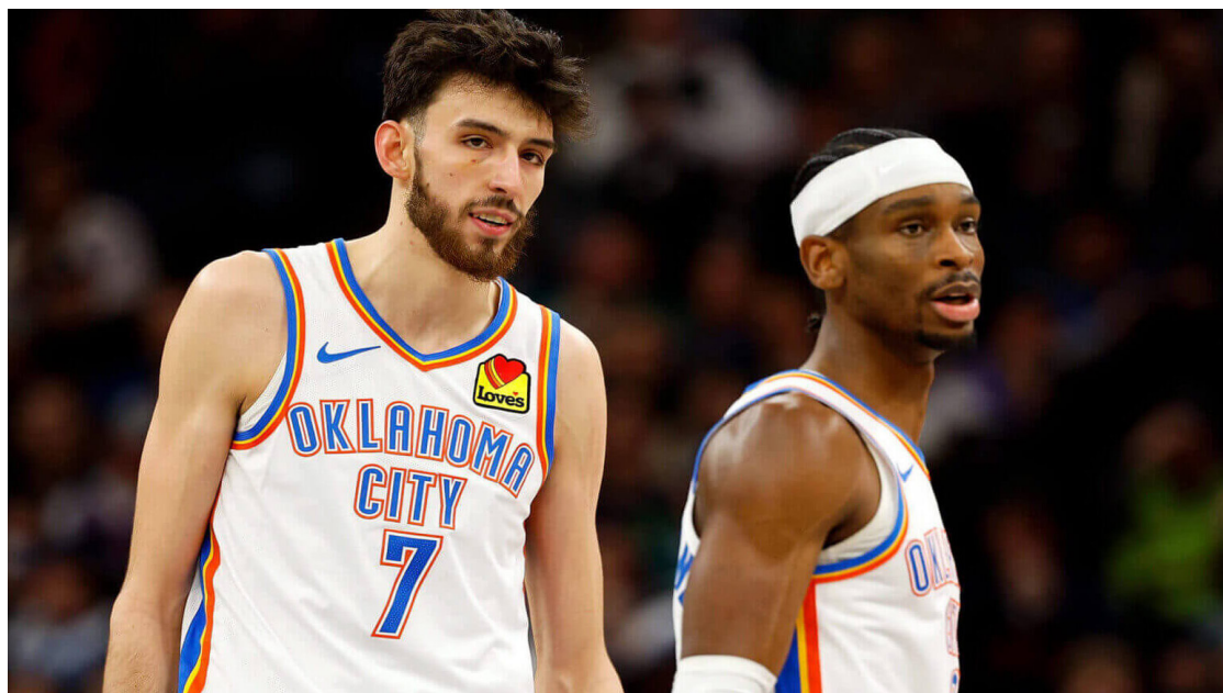
Shai Gilgeous-Alexander and Chet Holmgren are looking to win their first NBA Championship together.

San Antonio Spurs: The Spurs gained a veteran playmaker in the off-season, signing 39-year-old Chris Paul to a one-year deal. This move brings a strong pres-