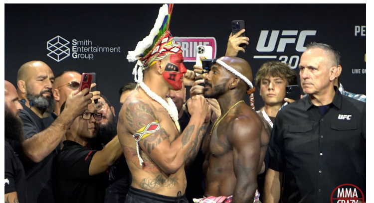
Alex “Poatan” Pereira faces off against Khalil “War Horse” Ibn Rountree Jr. ahead of their fight the Eastern Conference semifinals.

The bell rang and the fighters touched gloves. Immediately, Rountree pounced upon Perei-