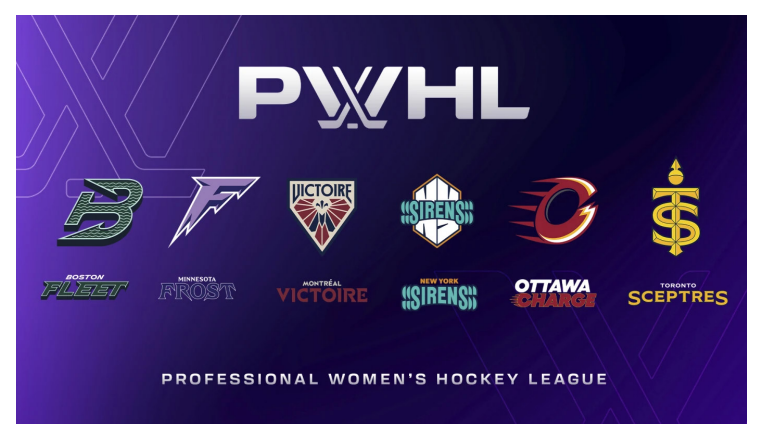
The PWHL currently consists of six professional teams.

The new names and logos of this league are well throughout, honoring history while looking ahead to the future. Jerseys look to be announced around late October or early November, as the PWHL finishes gearing up for another successful season.