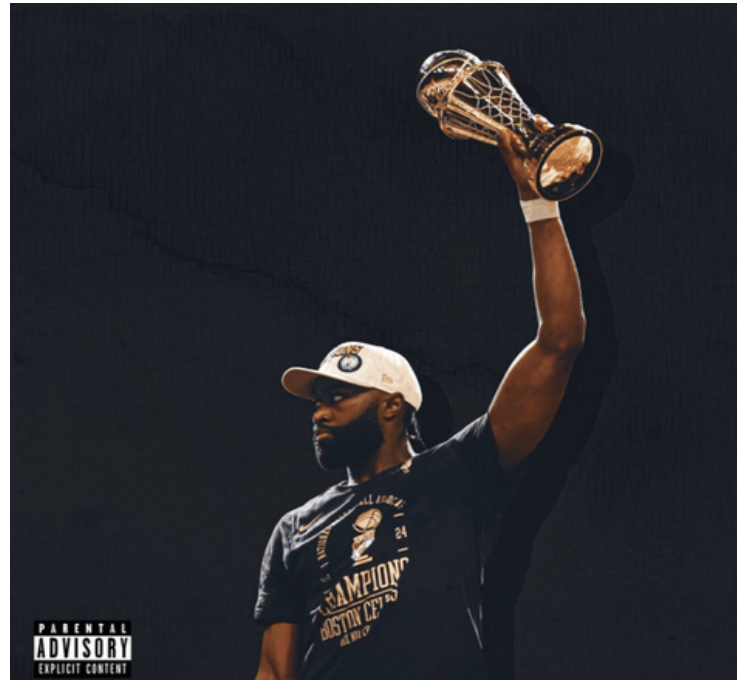
Jaylen Brown holding the NBA Finals MVP trophy as his song cover.

Furthermore, in most of the song, Brown raps about reeling from a major breakup, and about how he has been working through “problems too deep for any therapist.” However, any concerns Brown had are now in the past, as he has taken the time to enjoy himself this summer, recently vacationing in Bahrain and showing off his un-