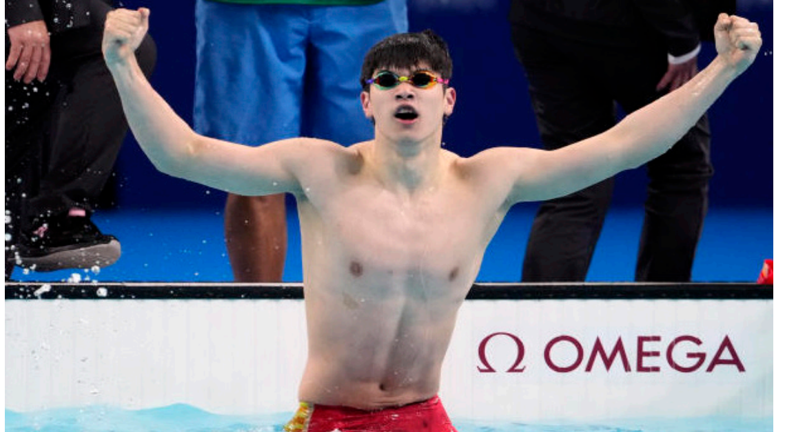
Pan Zhanle celebrates his new world record after winning the 100-meter freestyle in Paris.

A common argument against the addition of