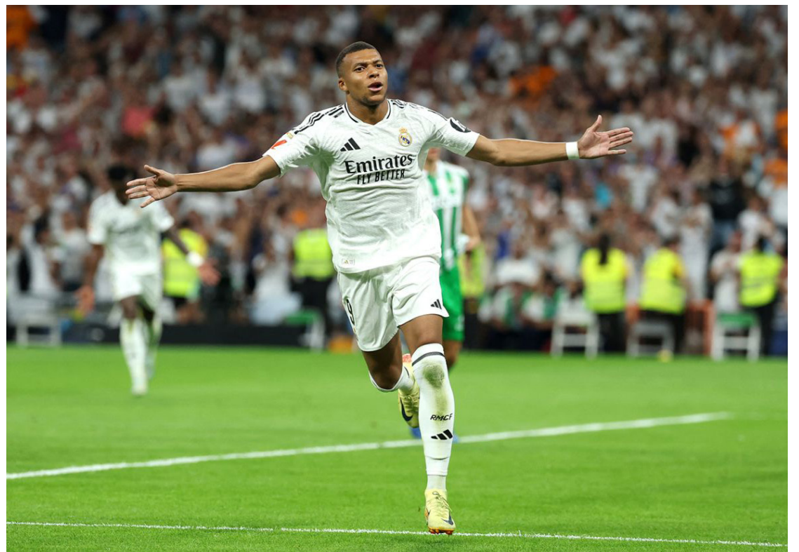
Kylian Mbappe celebrates his first goal for Real Madrid.

is a man of principle, and he will not let his players play without a sense of position. With due time, Ancelotti will figure out how to properly integrate Mbappe into the starting lineup, and when that day comes, a new dynasty might be formed.