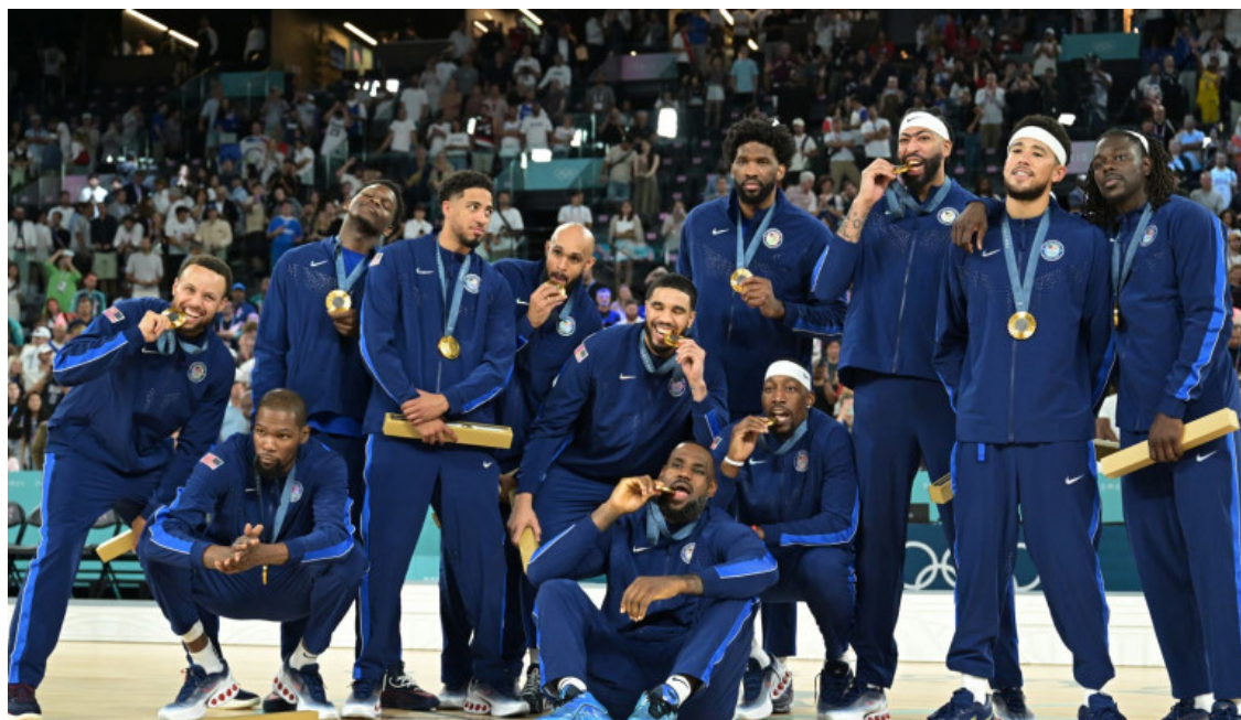
The USA Men's Basketball Team celebrates after beating France 98-87 in the gold medal match.

The quarterfinal seemed to be even less competitive than the group stages, with the USA team defeating Brazil 122-87. The semifinal, however, seemed closer than expected. Having defeated the Serbian team previously in the group stages, the Avengers seemed to be confident. However, it was only after a triple-double from LeBron James and a 36-point performance from Stephen Curry did the USA team win the game 95-91. Lastly, the final against France was a thriller. With three-time defensive player of the year Rudy Gobert and upcoming superstar Victor Wembanyama, this French team was seen as the biggest threat to team USA's gold medal. However, after another incredible performance from LeBron James and Stephen Curry, the USA team prevailed, winning their 17th gold medal in the Olympic Games.