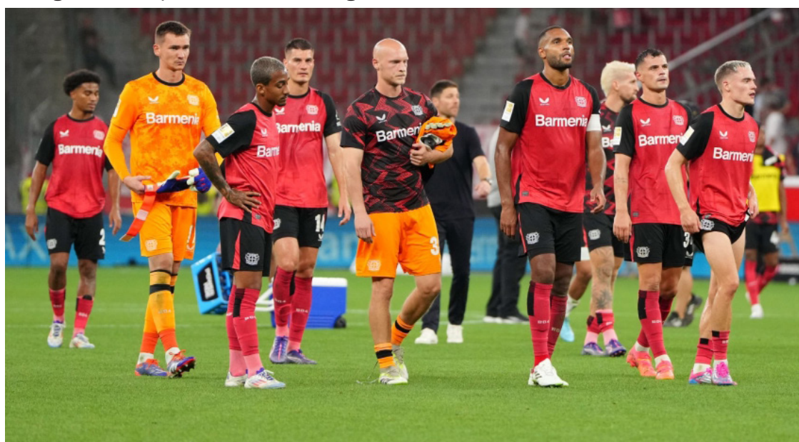
Bayer Leverkusen face the fans after losing to RB Leipzig.

Editor's Note: This article was written at the end of October.