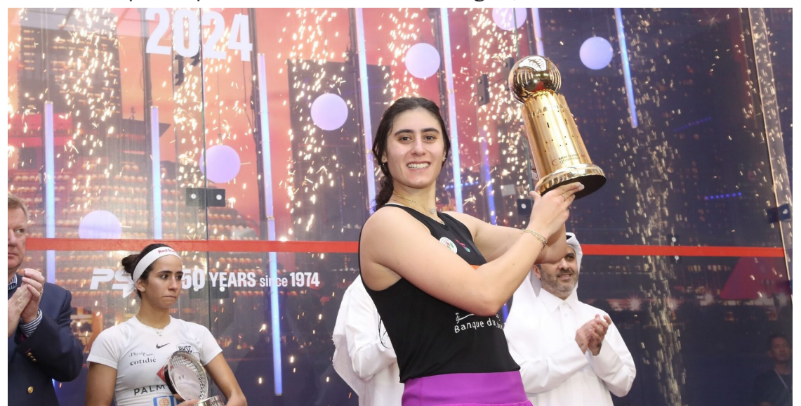
Nour El Sherbini raises her trophy after defeating Nouran Gohar in the Qatar Classic Final on October 5, 2024.

Both players will now focus their attention on their next tournament in Philadelphia. Coming off Platinum tournament victories in Qatar, Nour El Sherbini and Diego Elías hope to find the same success at the U.S. Open Championships.