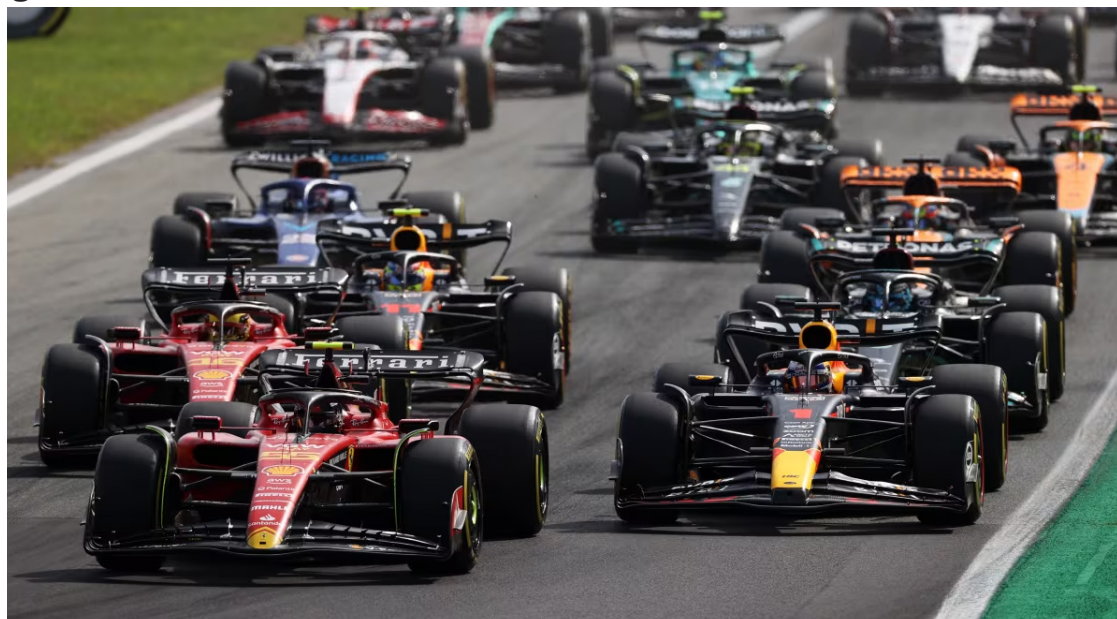
Carlos Sainz leads Max Verstappen and Charles Leclerc down a straight with the rest of the field behind them.

ty, particularly under pressure. Overall, the year promises to be ultra exciting, with the potential for many teams to compete for both the constructors and drivers championships.