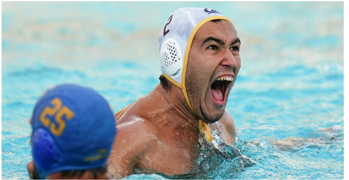
UC Berkeley wins third straight NCAA Men's Water Polo Championship.

in the NCAA Division I water polo championship will undoubtedly be marked in the archive of sports history, showcasing the indomitable will and spirit of UC Berkeley's athletes.