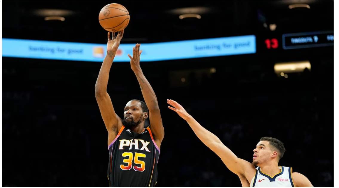
Kevin Durant is a two-time NBA Champion and one-time MVP.

Kevin Durant passed Moses Malone in a 119-111 loss to the Denver Nuggets to enter the top ten. He scored a little less than 50 percent of his points with the Thunder and has scored the rest with the Warriors, Nets, and Suns. Durant is arguably the NBA's most dynamic scorer of all time, scoring from all three levels at nearly seven feet tall. He is a trailblazer for the next generation of