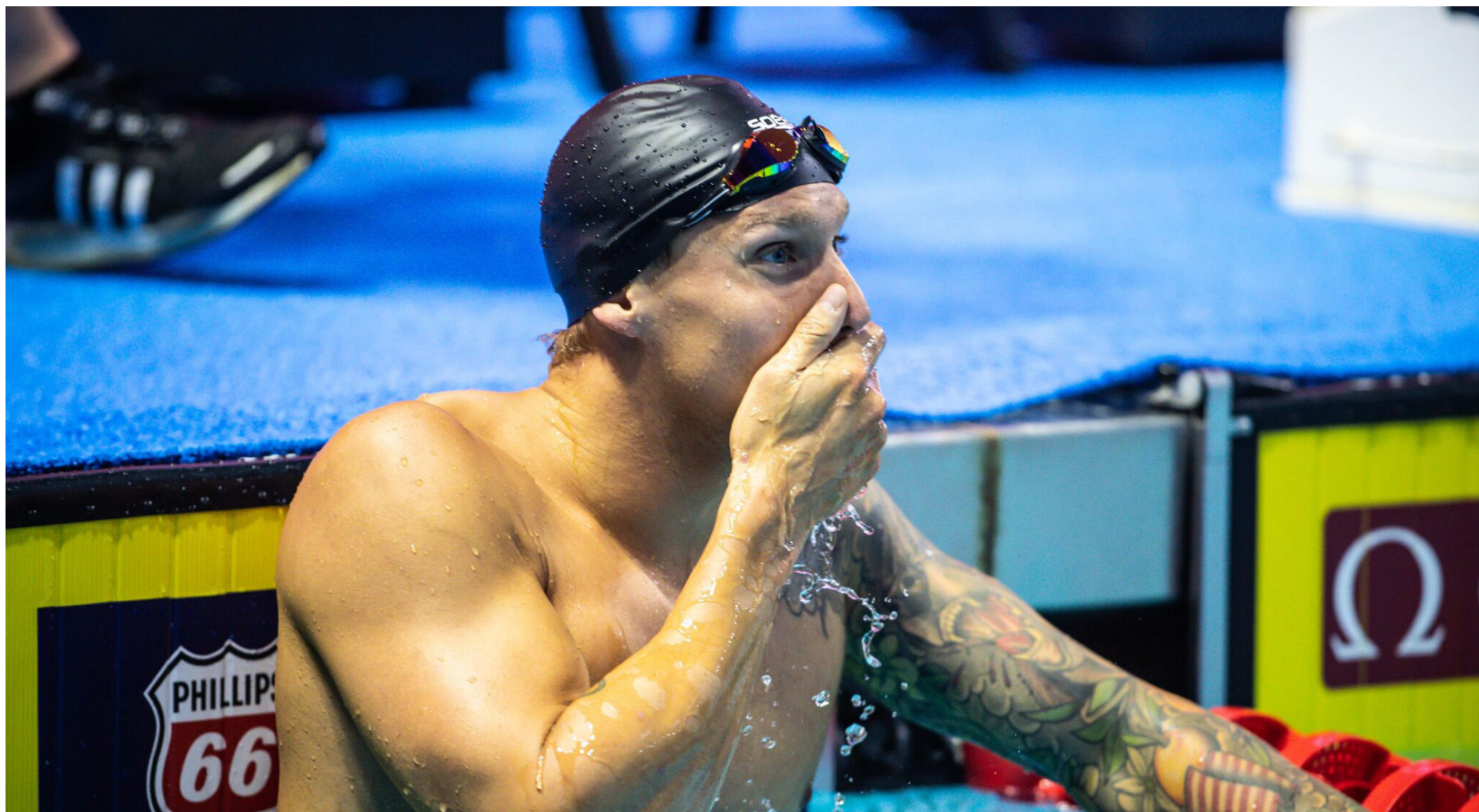
Caeleb Dressel celebrates after winning the 100m fly.