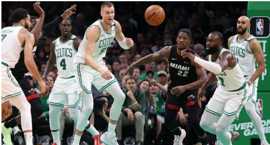
The Boston Celtics' starting five for the 2023-24 NBA Season.

Despite this, not much else can be said against this Celtics team. On paper, they have it all this year. Talent, chemistry, and a flawless balance of playstyles and skillsets. However, one issue that the Celtics need to overcome to make the final push for gold is efficiency. No player is averaging more than 60 percent true shooting percentage, an advanced statistic that measures a player's efficiency. But time and time again, the NBA shows that simply having the numbers on your side isn't enough, and although Boston is No.1 in the East at 16-5, only time will tell if they can finally bring it home in the postseason.