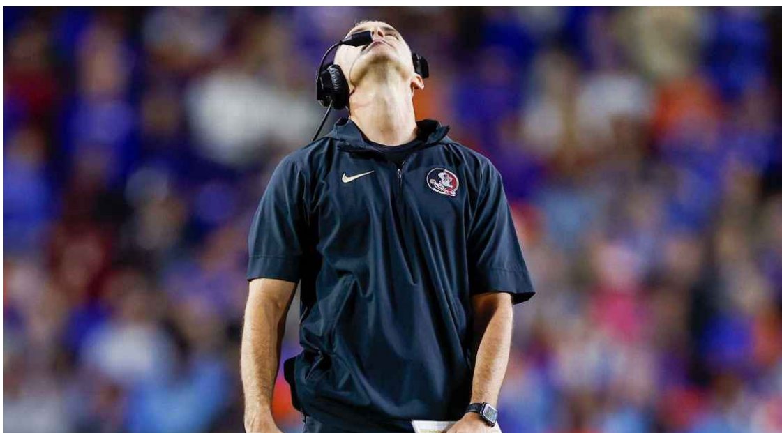
Mike Norvell started coaching Florida State in 2019.

The Seminoles will compete against No. 6 Georgia in the Orange Bowl on December 30. Although a win would not change the outcome of the committee's decision, FSU would prove to everybody that they could compete in the CFP. No. 4 Alabama will take on No. 1 Michigan in the Rose Bowl on January 1. The winner will play the winner of No. 2 Washington against No. 3 Texas in the national championship.