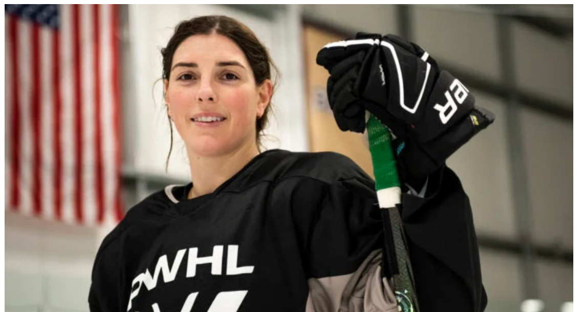
Hilary Knight will captain the PWHL Boston women's team.

Toronto and Minnesota on February 3, 2024. Depending on the person, a fresh start may or may not be what women's hockey needs, but this new league will be exciting and hopefully profitable enough to stay in one league.