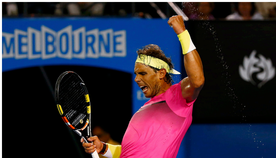
Rafael Nadal after winning in the third round of the 2015 Australian Open.

It will be a privilege for all the world to see Nadal light up the court again, whether or not it is his last rodeo. Rather than criticizing his decisions, we should graciously watch him fly across the court, battle through fatigue, and hopefully win another slam.