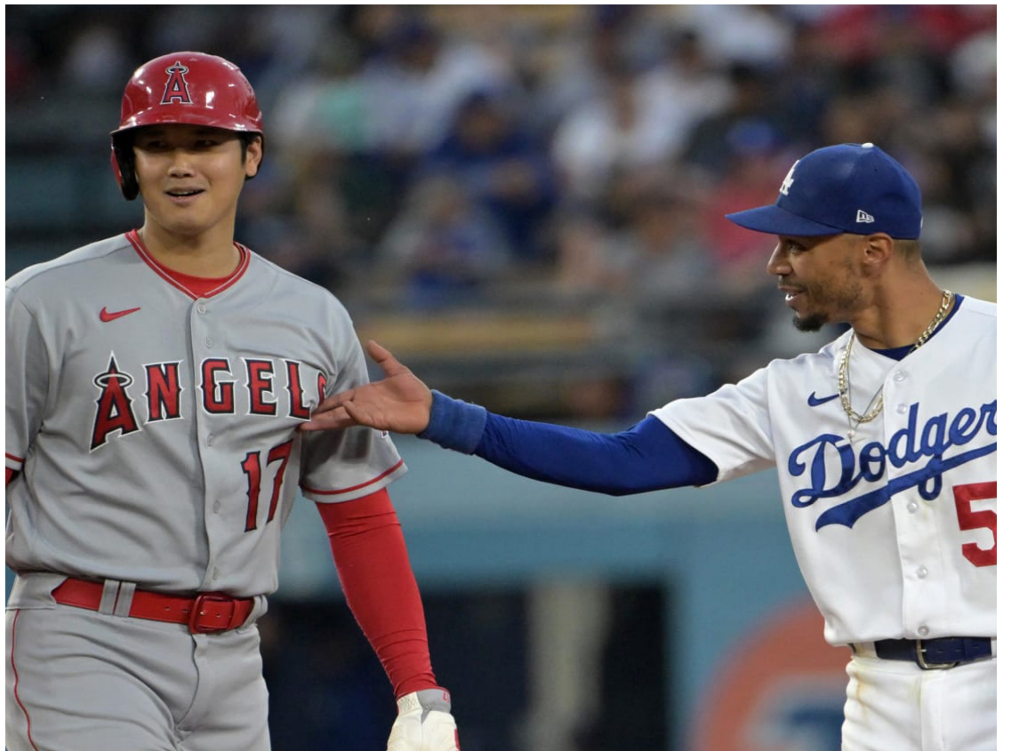
Shohei Ohtani (left) conversing with new teammate Mookie Betts (right) after Ohtani gets on base.

However, it's not all smooth sailing. There are still certain uncertainties that should be considered. First off, his injury history. Of the last 5 years he played, he tore his UCL (Ulnar Collateral Ligament) twice while also receiving one of the most degrading surgeries in the Tommy John Surgery. He is also not expected to be able to pitch until the 2025 season due to current arm injuries. Another aspect we must factor in is his age. Ohtani is currently 29 years old. That means his contract will end at age 39. Who knows the production he will be able to maintain by then? An example of a failed contract due to age is that of Albert Pujols. His age