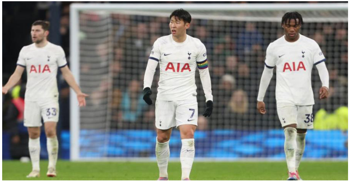
Tottenham are the first team in Premier League history to score the first goal in five successive matches without winning any of them.

can be attributed to long-term injuries to key players. Their current injured list includes Ivan Perisic, James Maddison, Rodrigo Bentancur, Micky van de Ven, Ryan Sesessgon, Eric Dier, and more. Many of these players became key starters for Spurs over the early part of the season, such as James Maddison, who provided eight goal contributions in 11 games before suffering a severe ankle injury. Micky van de Ven was also having a stellar season, quickly becoming one of the first names in the starting XI following his move from Wolfsburg in Germany. These injuries forced the Spurs to field an unfamiliar team that lacked conviction and chemistry. The spontaneous combination of inexperienced players like Destiny Udogie and Brennan Johnson, age 21 and 22, respectively,