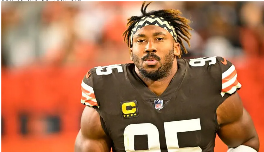
Myles Garrett is the centerpiece of an outstanding Cleveland Browns defense.