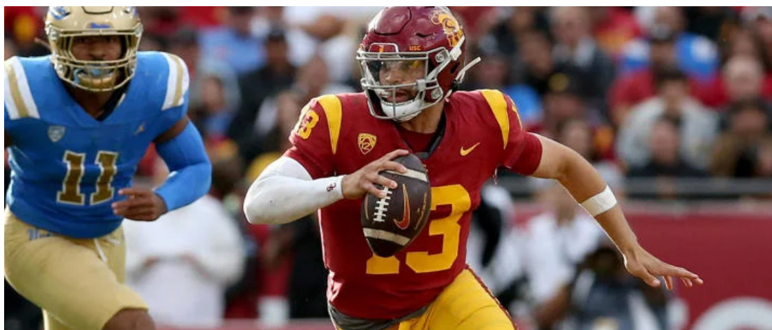
Caleb Williams is a capable playmaker who leads the race for the No. 1 overall draft pick.

about the No. 1 overall draft prospect, it raises the question: what team would this player most likely go to? At the moment, it looks as if the Bears will have the No. 1 overall draft pick for the 2024 draft. While they took quarterback Justin Fields just three years ago with the 11th overall pick, he has yet to show that he is a good fit for the Bears. They have also struggled at the quarterback position with Mitchell Trubisky, who was replaced as well. This has led to many consecutive dis-